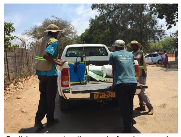
Budiriro teams loading car before intervention

To ensure a regular communication between team leaders, a decision was taken to create a