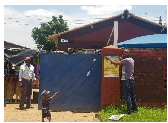
Neighbors of a case sticking the received posters on t he wall and gate of their property.

being distributed, there is a clear request for more information.